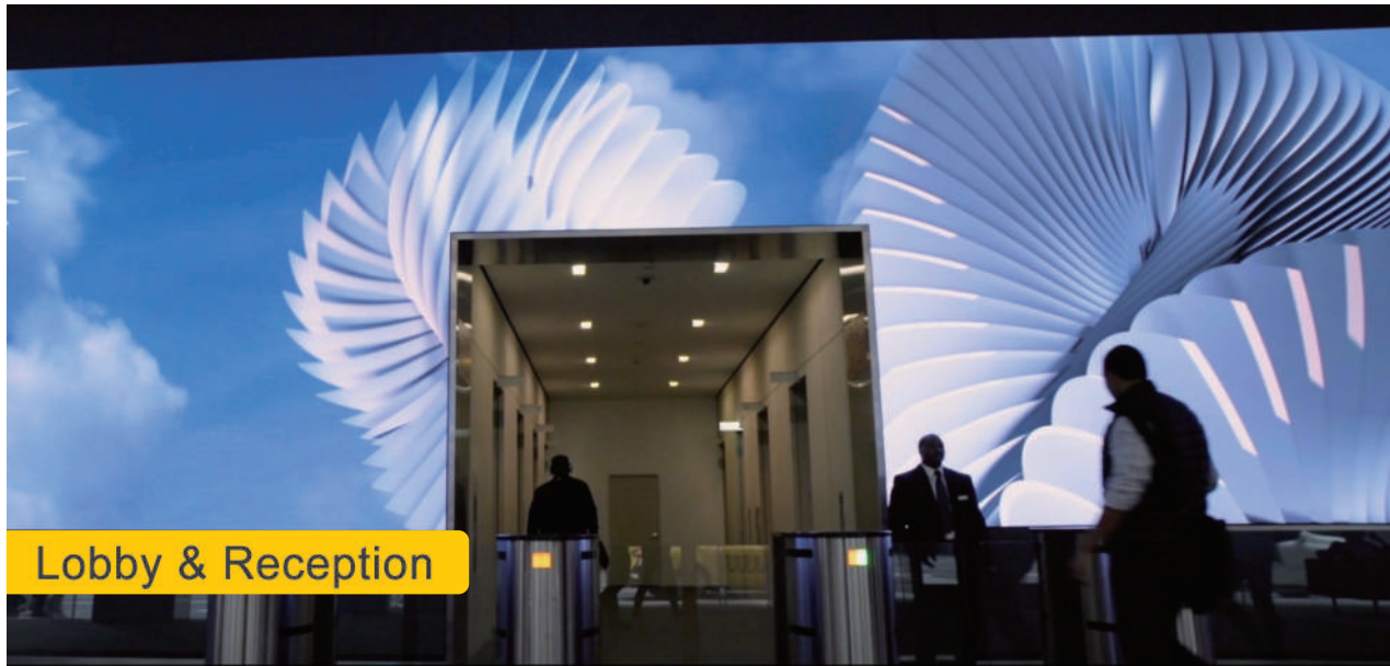
Lobby & Reception