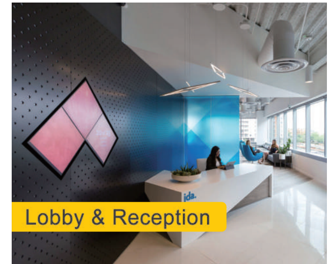
Lobby & Reception