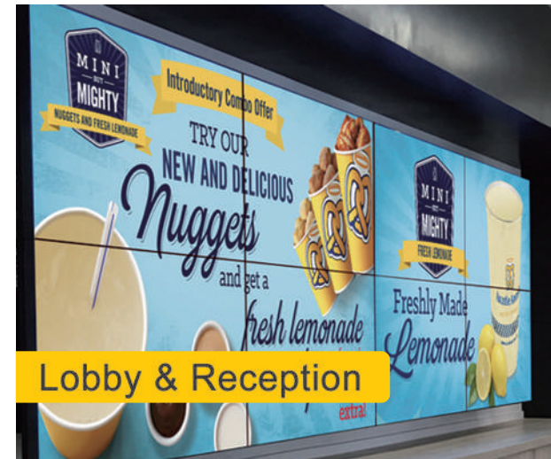
Lobby & Reception