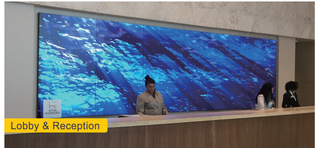
Lobby & Reception