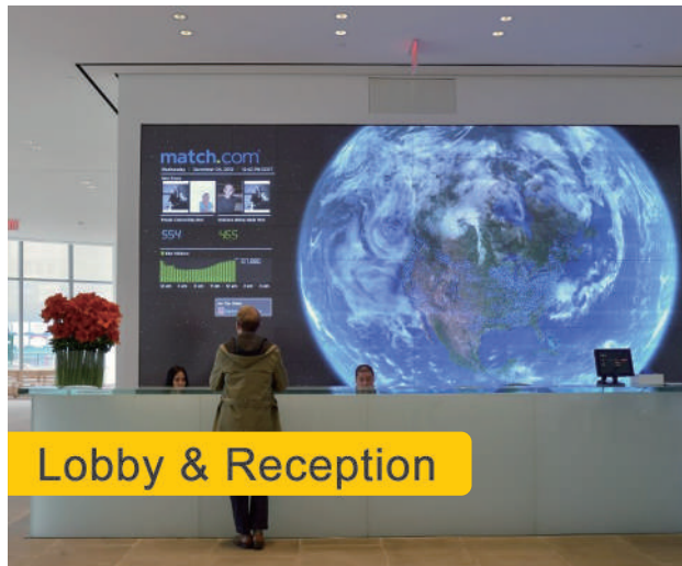
Lobby & Reception