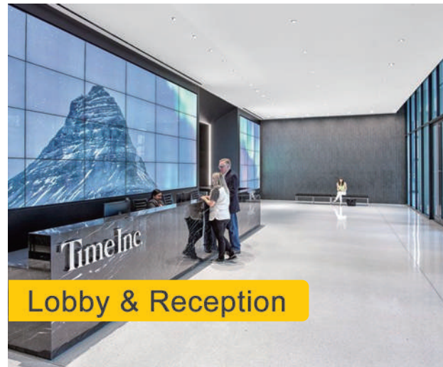
Lobby & Reception