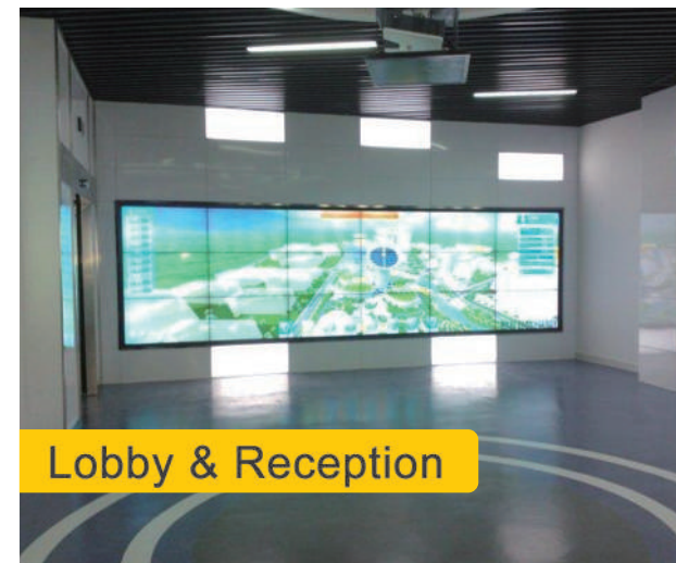
Lobby & Reception