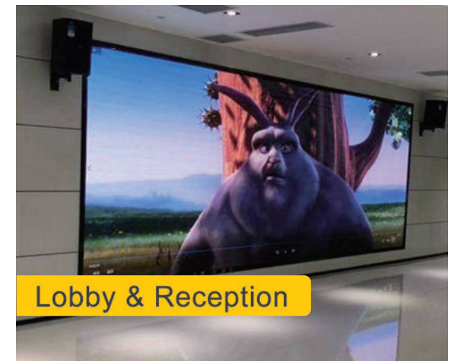
Lobby & Reception